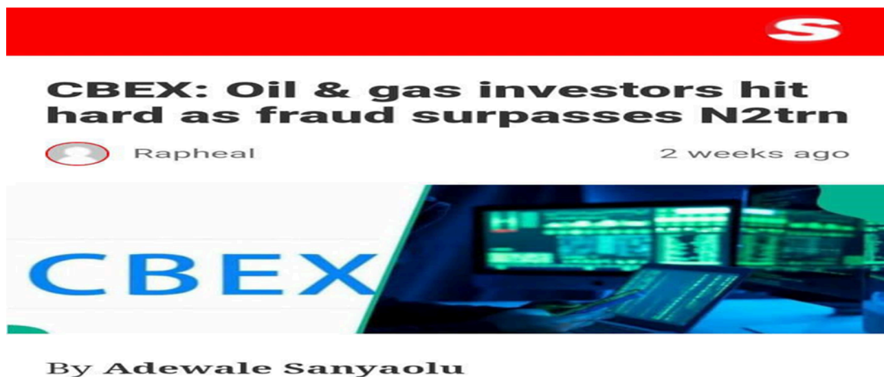
Figure 5: The Investment Downturn