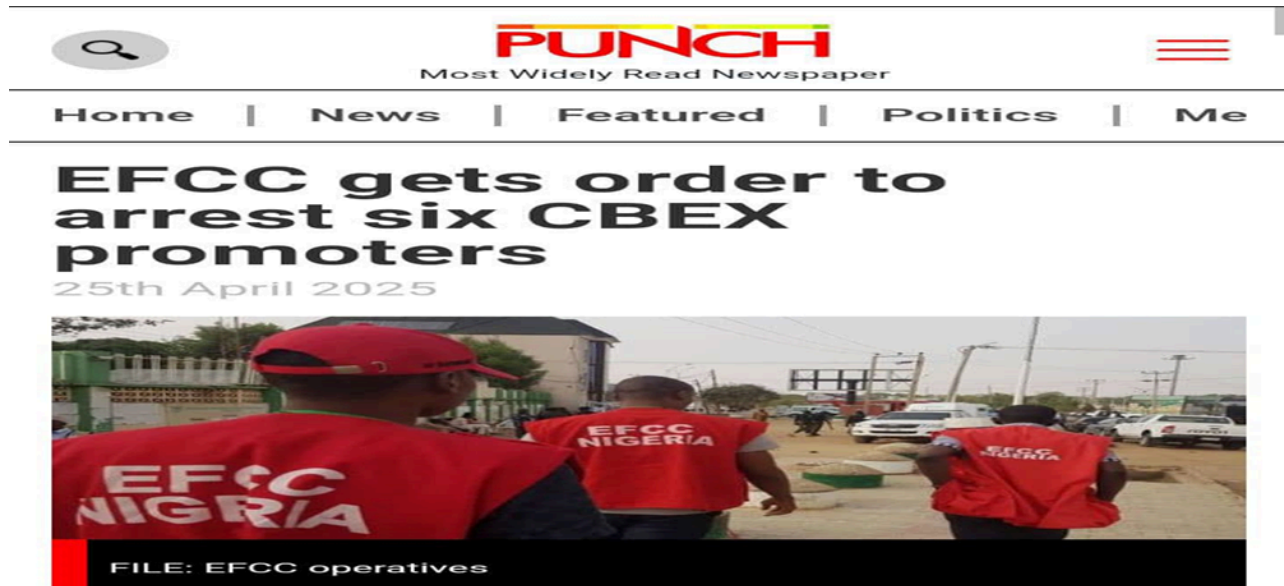
Figure 6: EFCC Officials Authorized to Detain CBEX Promoters

shared community concern for those impacted by the fraudulent activities linked to CBEX. Moreover, the framing sheds light on a wider socio-economic discourse, hinting at systemic failures within the financial sector, particularly regarding the regulation of investment platforms related to oil and gas. It highlights vulnerabilities common to developing economies such as Nigeria, where investors, often lacking substantial financial literacy, are vulnerable to predatory schemes.