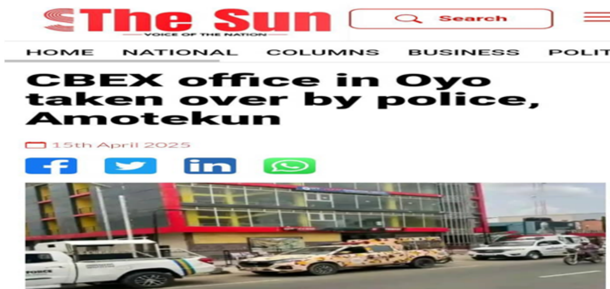
Figure 1: Law enforcement Agents Surround the CBEX Office.

This study investigates how the CBEX Ponzi scheme in Nigeria is portrayed through a multimodal discourse analysis framework. It examines how visual and verbal components in the Sun and Punch newspapers work together to shape the narrative about the Ponzi scheme. The analysis explores the implications of this framing for the audience and considers the socio-cultural impacts of the media strategies employed. The presentation of data and findings begins with a detailed review of the Sun newspaper's approach to this issue.