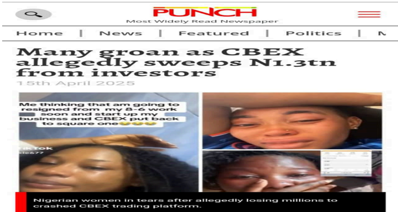
Figure 8: Investors Mourning Their Lost Investments