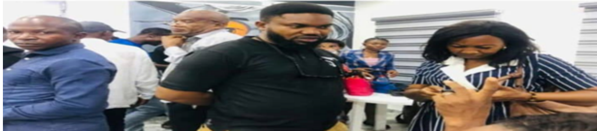
Figure 3: Investors Crowd CBEX Office in Lagos Regarding Missing Funds