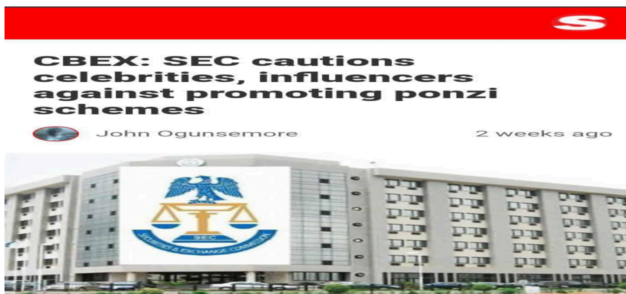
Figure 2: Visual Representation of Regulatory Authority