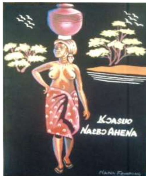
Figure-6- kɔasɔ næbɔ ahena by Nana Frimpong, acrylic on canvas, 14" x 21", 2007

The title of the painting is 'Kɔasɔ Næbɔ Ahena' rendered in acrylic on canvas. The size of the work is 14" x 21" created in 2007. In the foreground of the painting is one female figure in a loin cloth carrying a pot of water returning from the river side. In the background, are an abstracted river bank, trees and birds (a common feature of Nana's paintings). At the lower right of the composition is a rendition of an Akan maxim which is the title of the work.