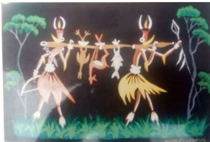
Figure-3- Tropical Hunter by Nana Frimpong, acrylic on canvas, 14" x 21", 2011, Courtesy the artist's collection

The painting is titled, 'The Tropical Hunter' rendered in acrylic on canvas. The size of the work is 14" x 21" created in 2007. The artwork depicts a hunting expedition by two indigenous Northern Ghanaian hunters.