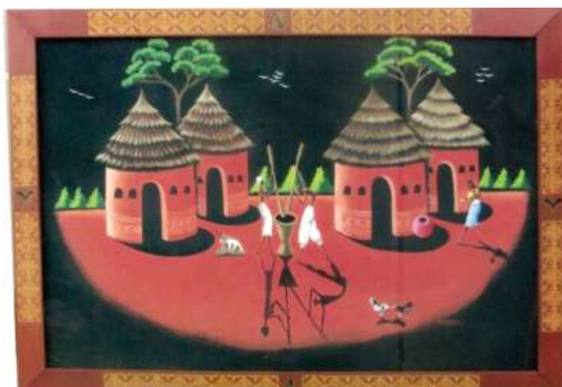
Figure 4- The Northern Village by Nana Frimpong, acrylic on canvas, 14" x 21", 2012, Courtesy the artist's collection

The painting is titled, 'The Northern Village' rendered in acrylic on canvas. The size of the work is 14" x 21" created in 2012.