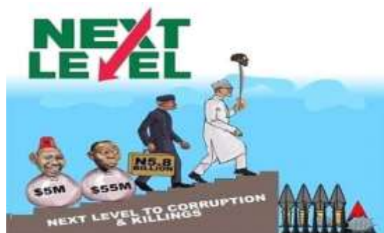
Figure 1: Negative Out-group Polarity Campaign Ad