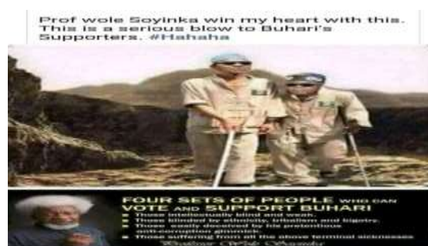
Figure 3: Negative Out-group Polarity of APC