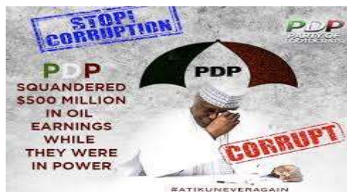
Figure 8: Negative Out-group Polarity of Atiku