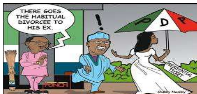
Figure 4: Negative Out-group Polarity of Atiku