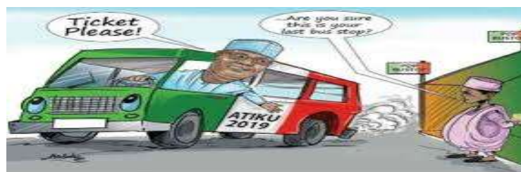
Figure 6: Negative Out-group Polarity of Atiku