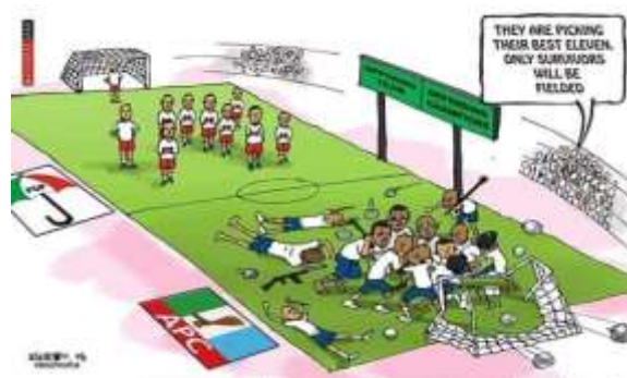
Figure 2: Negative Out-group Polarity of APC

Source: Mike Asukwo on mobile Twitter.com https://www.mobiletwitter.com