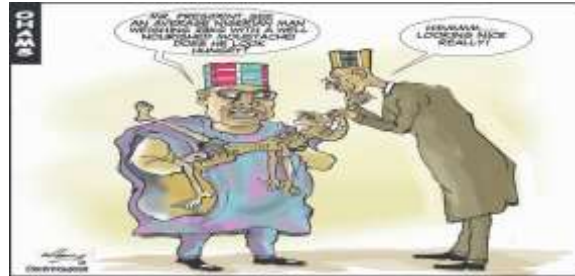
Figure 7: Negative Out-group Polarity of Buhari