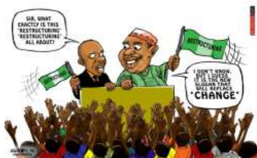
Figure 5: Two politicians