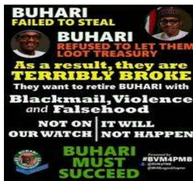
Figure 9: Positive In-group Polarity of Buhari